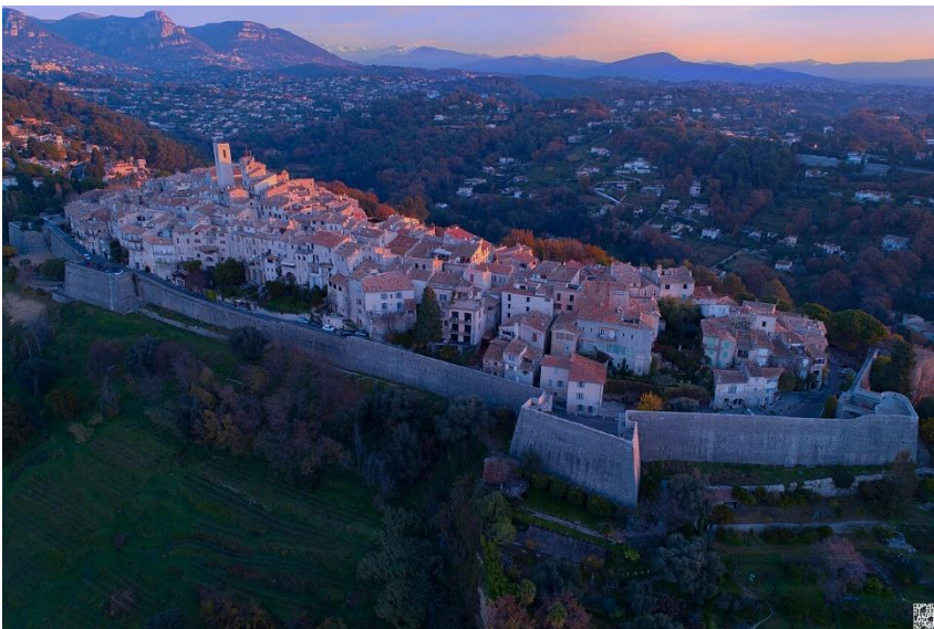
< The fortified town of Saint-Paul-de-Vence

Day 5 - Monday, March 9: After breakfast, we first explore Old Nice's antiques and flea market, then head for the fabulous Marc Chagall Museum , featuring a marvelous collection of the Russian-French artist's paintings, drawings, prints, sculptures, ceramics, stained glass, tapestry and mosaics, inspired by colourful inventions and a universal message of peace are combined. Returning to the city centre, we visit the Belle Époque-style Masséna Museum , “where history and art meet to reveal the exceptional heritage of the Côte d'Azur in the heart of magnificent gardens”.