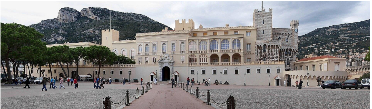
The Prince's Palace in Old Monaco

Day 4 - Sunday, March 8: Full-day excursion by private coach to Monaco-Monte Carlo. We motor to the principality via the scenic coastal road, the “Basse Corniche”, featuring some superb vistas of wonderful coastal communities (and jet-set resorts) such as Beaulieu and Saint-Jean-Cap-Ferrat. In the principality, our visit will start with the yacht harbour, then continue with the old town of Monaco, perched high on a rock and featuring the Palace, Cathedral, and Oceanographic Museum. After a group lunch in a typical restaurant, and finish with the mainland district of Monte Carlo, featuring the world-famous Casino. Returning to Nice, we enjoy the spectacular mountain road, with a stop in the picturesque hilltop town of Eze.