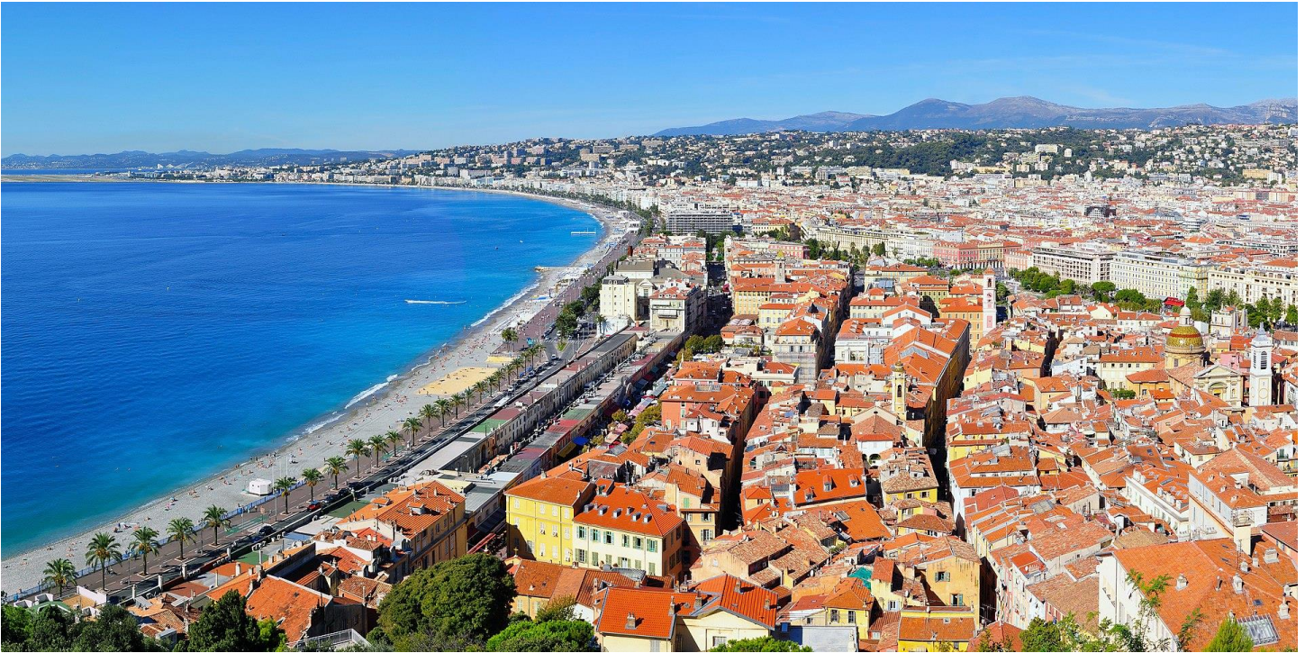
Panoramic view of Nice, with the old town in the foreground and our hotel located almost exactly in the centre of the picture, at the end of the old town and very close to the beach.