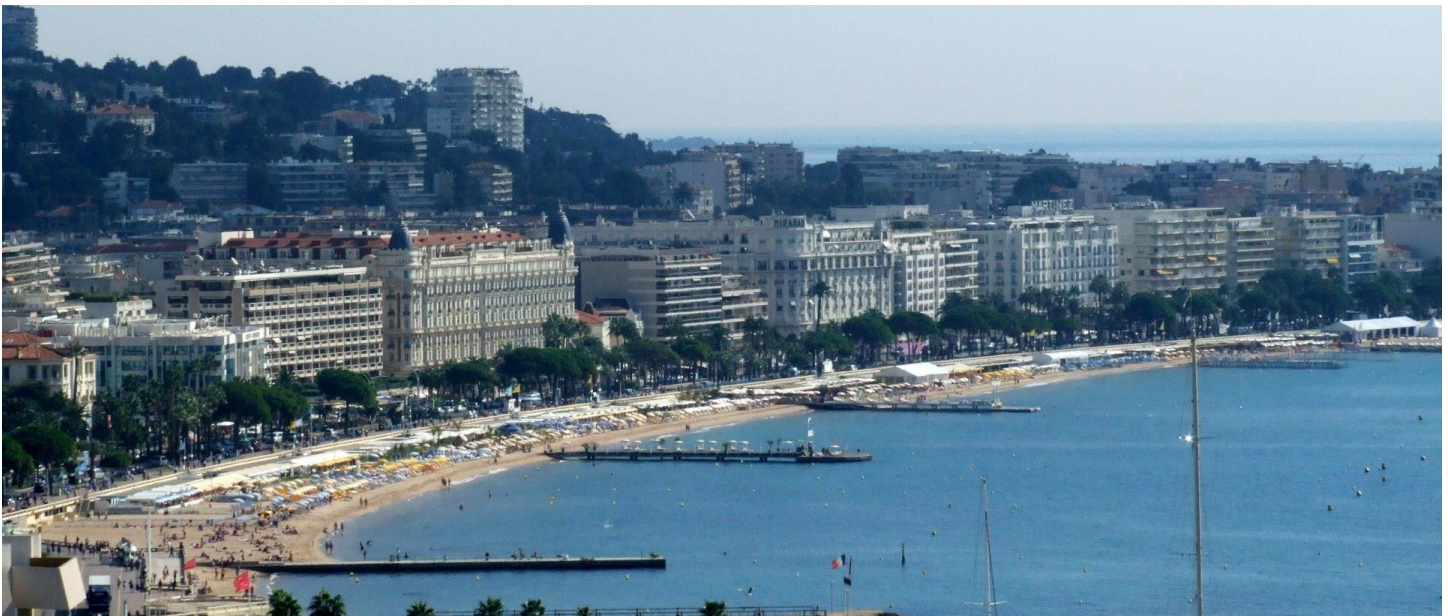
^Cannes' La Croisette waterfront boulevard

Day 9 - Friday, March 13: Your last day in Nice is entirely "at leisure," except for this evening's "au revoir" dinner in a typical restaurant.